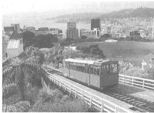
Wellington Cable Car

There is ongoing pragmatic research underway at Victoria University of Wellington, which I was lucky enough to be part of during my sabbatical in the 2006 academic year. In this report, I introduce the university and in particular the Language in the Workplace Project, which has researched many areas of relevance to pragmatic scholars. Then I focus on politeness in the workplace, one of their most recent research areas, because it corresponds to my personal research interest.