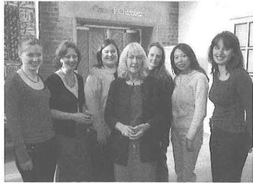
Members of the LWP Team at Launch of Gendered Talk at Work